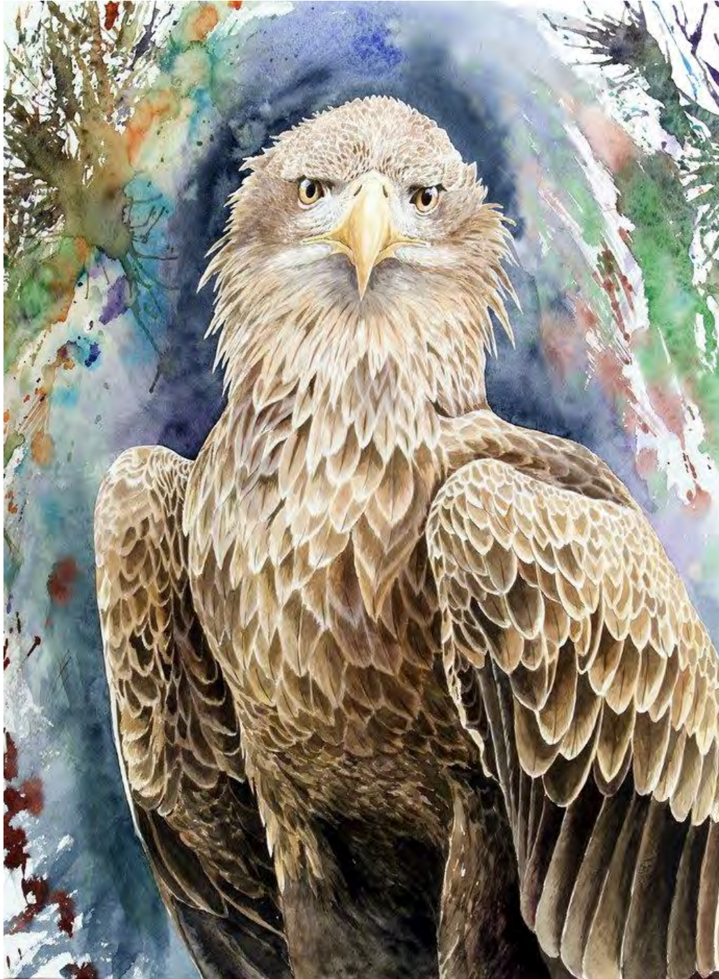
Illustration: Martin Weixelbraun

International DANUBEPARKS White-tailed Eagle Conference Szeksard, 17 th -18 th October, 2011