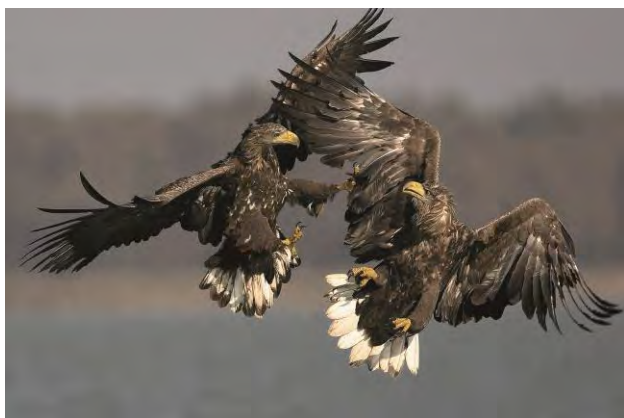
The White-tailed Eagle – a flagship species for nature conservation along the Danube river